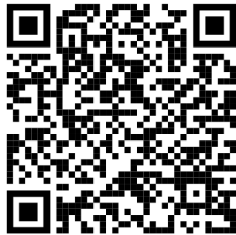
History GCSE Sharepoint QR link